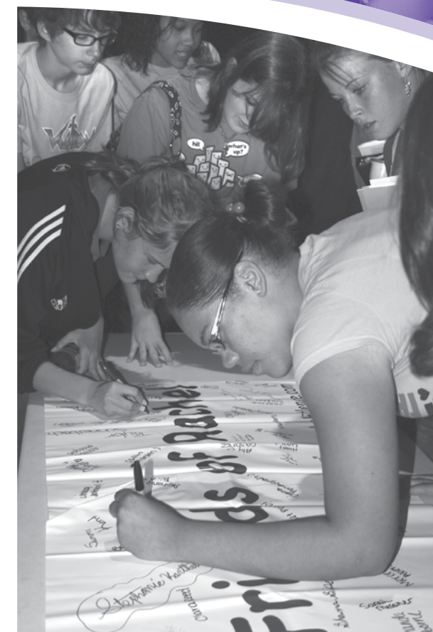
Students involved in the Friends of Rachel program sign a poster to show their commitment to treat others with compassion and kindness.